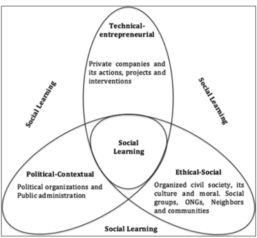
Figure 2: Working with people model dimensions.