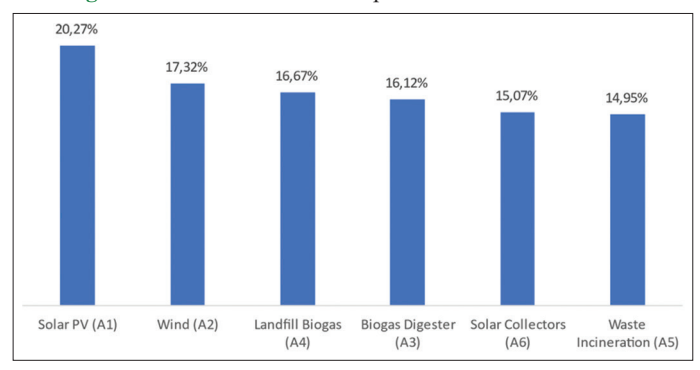
Figure 6: Global results for the prioritization of alternatives

with the social criteria, the PV solar energy alternative (A1) obtained the highest percentage for the 4 technical sub-criteria considered in the work.